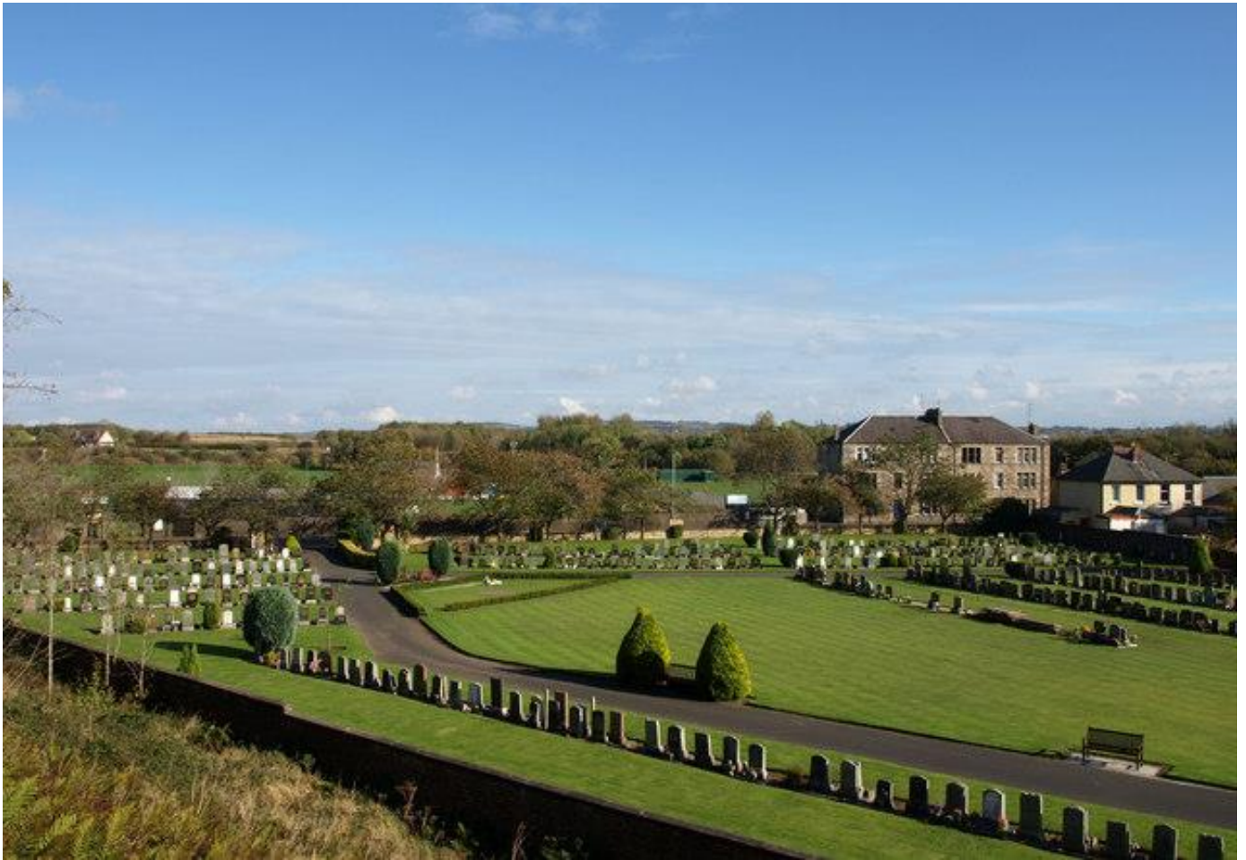
Kilbirnie Cemetery