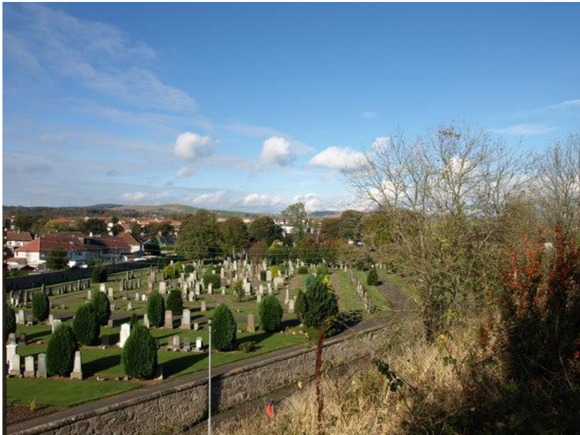
Kilbirnie Cemetery